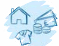
Article 1, Protocol 1 The right to peaceful enjoyment of possessions