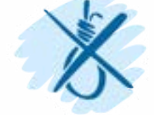
Article 1, Protocol 13 Abolition of the death penalty