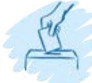
Article 3, Protocol 1 The right to free elections