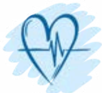
Article 2 The right to life

There are 16 human rights in the Human Rights Act , found in Schedule 1 . All public officials have a duty to respect, protect and fulfil these rights.