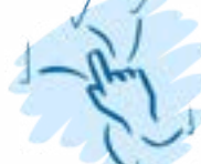
Article 8 The right to respect for private and family life, home and correspondence