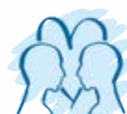
Article 12 The right to marry and start a family