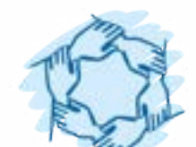
Article 14 The right to be free from discrimination