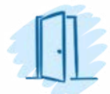
Article 5 The right to liberty