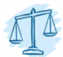
Article 6 The right to a fair trial