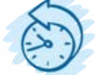
Article 7 The right not to be punished for something that wasn't against the law when you did it