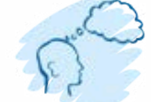
Article 9 The right to freedom of thought, conscience and religion