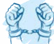
Article 4 The right to be free from slavery and forced labour