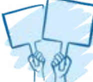
Article 11 The right to freedom of assembly and association