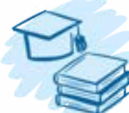
Article 2, Protocol 1 The right to education