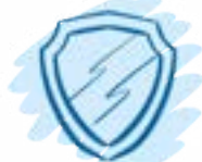
Article 3 The right to be free from torture and inhuman or degrading treatment