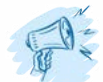
Article 10 The right to freedom of expression